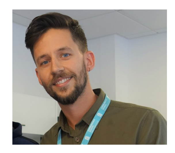
How would your best friend describe you? Easy-going, friendly and loyal.

My dad because he's an English teacher too. He's kind and he's got a great sense of humour. I look up to him a lot because he's an inspiring and enthusiastic person.