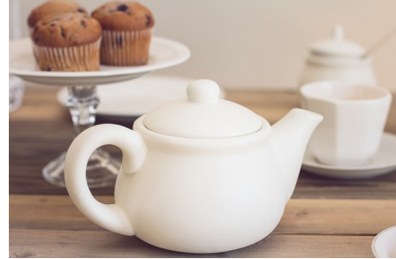
2. Ladies Club - every Wednesday - come and join us for tea and cakes!