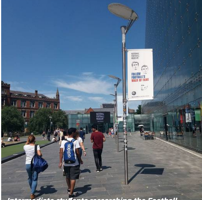
Intermediate students researching the Football

office@communicateschool.co.uk. You can also send your photos via WhatsApp or tag us on Instagram @communicateschool.